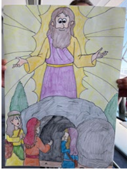
The Easter story drawn by the youth.

next-door neighbor of the church and his teenage son that is mourning the death of wife and mother. Another woman encouraged others in her church to invite a seeker to watch a Christian-based movie together. One pastor's wife asked me to provide a prayer plan for Lent that she could follow during the Holy Week