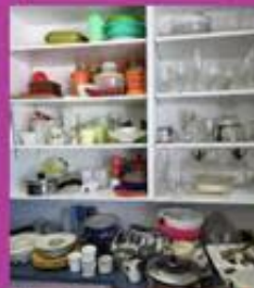
Dishes & Housewares