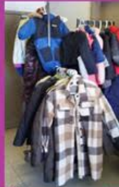
Snowsuits & coats